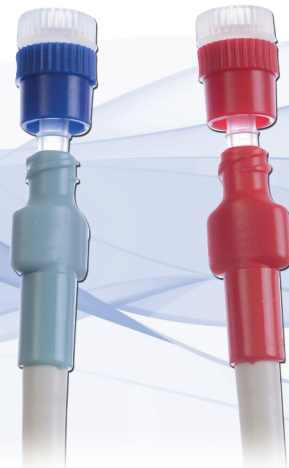
See-Luer™ Cap in OPEN Position.